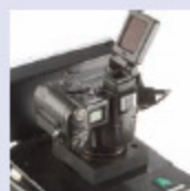
high resolution 8MB digital camera