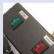
separate power and light switches