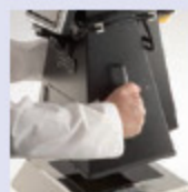
easily lifted on and off transilluminator