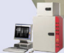
Complete range of gel documentation, chemiluminescent and fluorescent systems available, please inquire