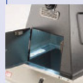
internal illumination when door is open